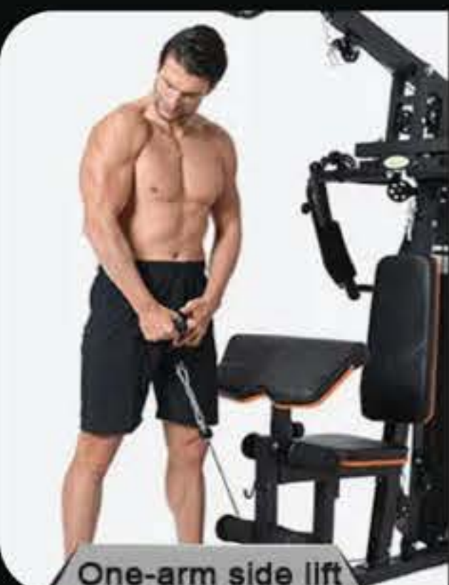
One-arm side lift