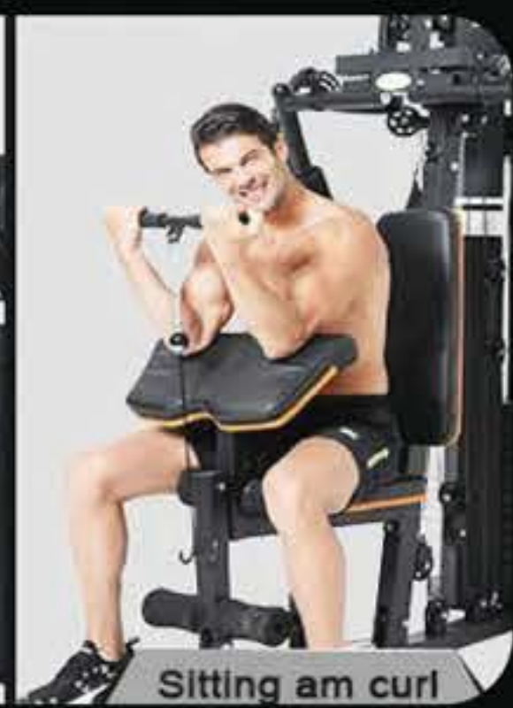
Sitting arm curl