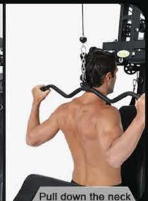
Pull down the neck