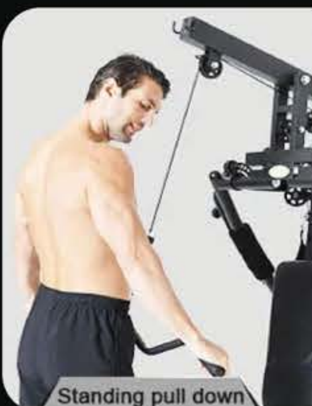
Standing pull down