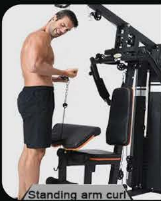
Standing arm curl